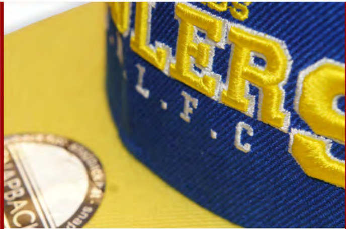
3D Front Embroidery