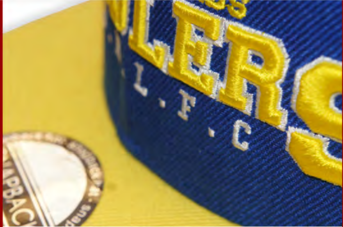
3D Front Embroidery