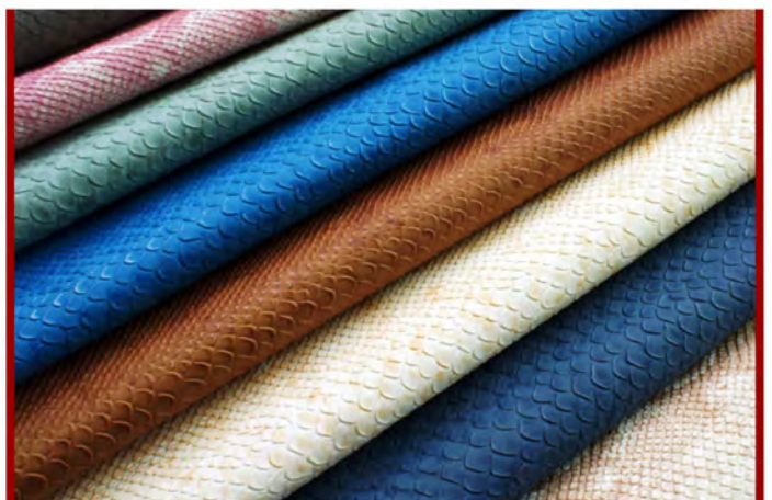
Large Selection Of Colours