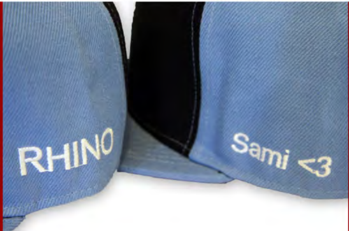
Individual Embroidered Names